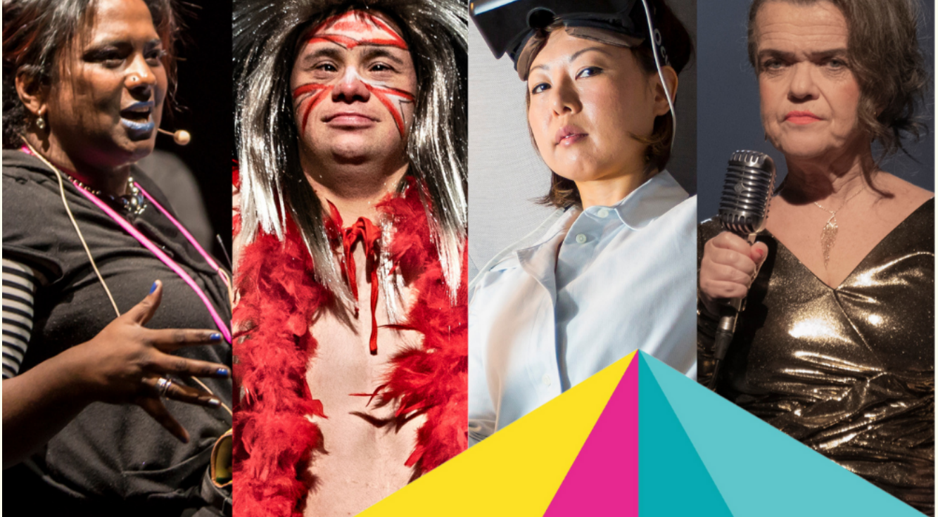
Arts Activated Conference August 9,16,23 2021 Online + Live