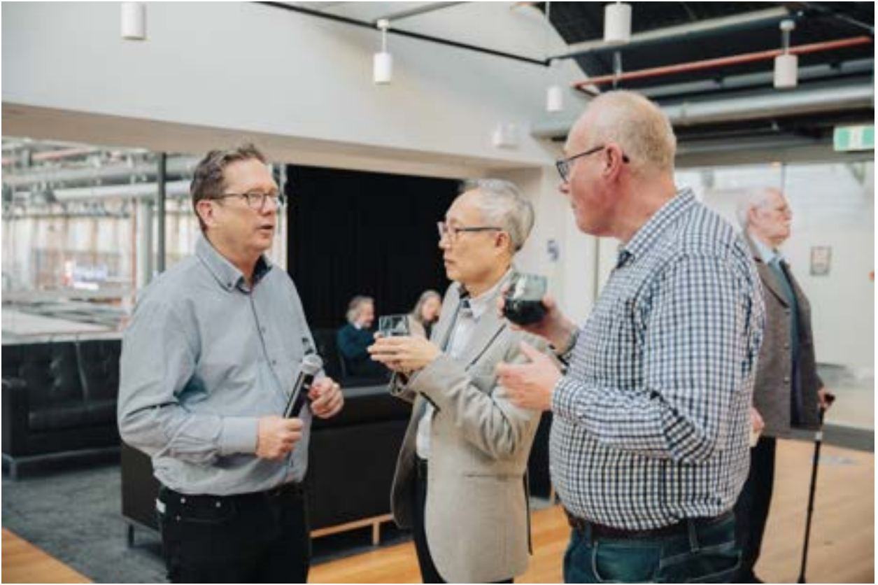
49 - 2RPH guests