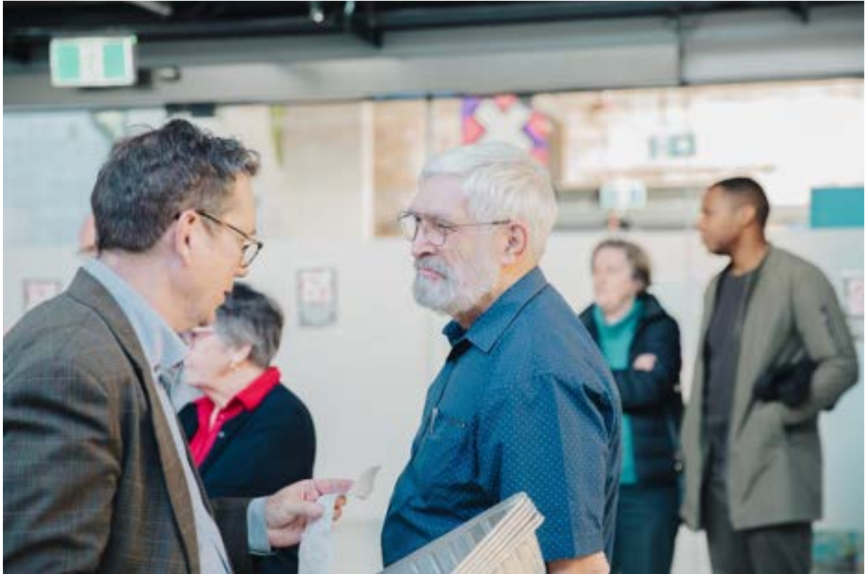
53 - 2RPH guests