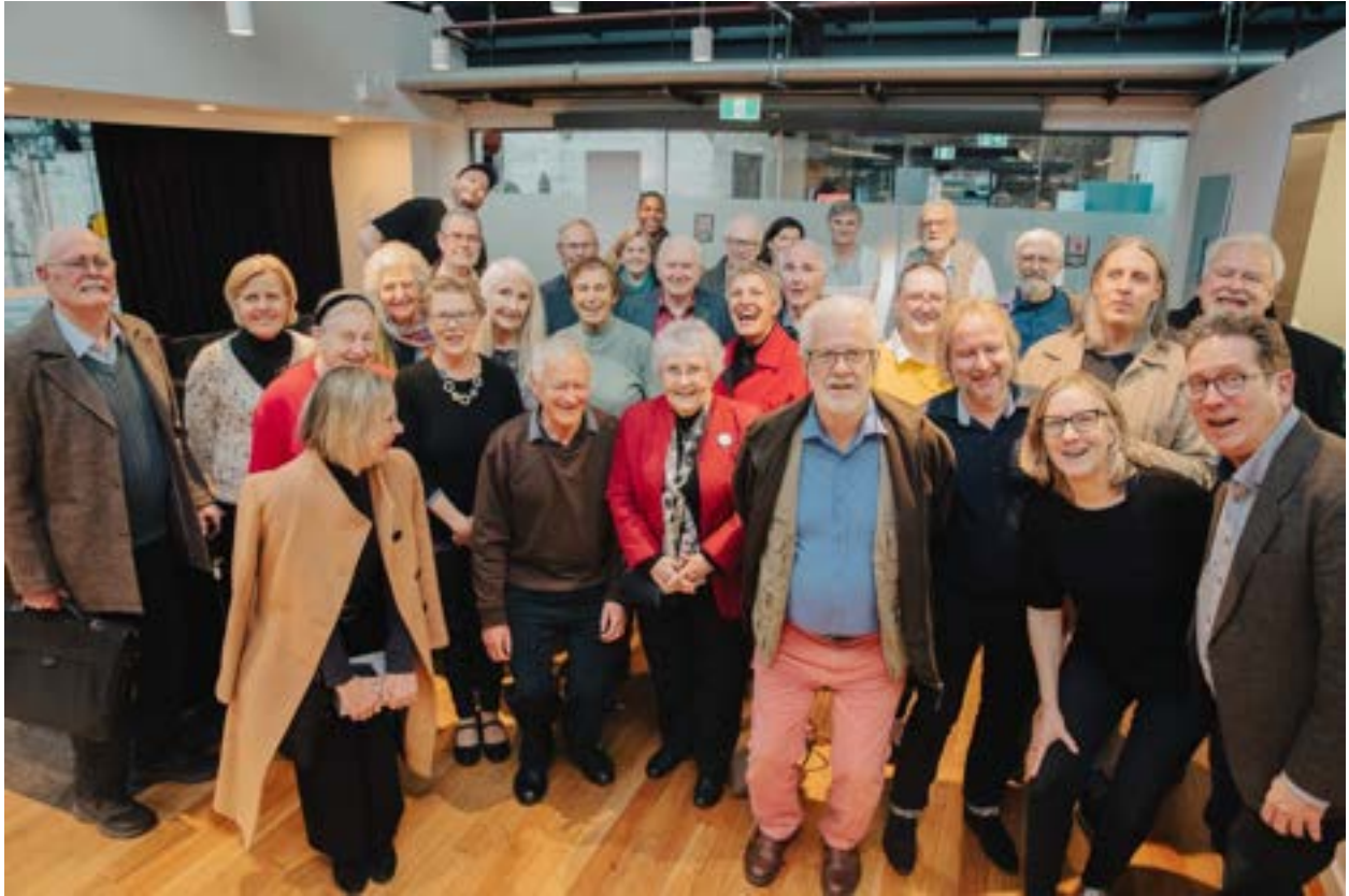
19 - Another group shot of 2RPH staff, volunteers and guests