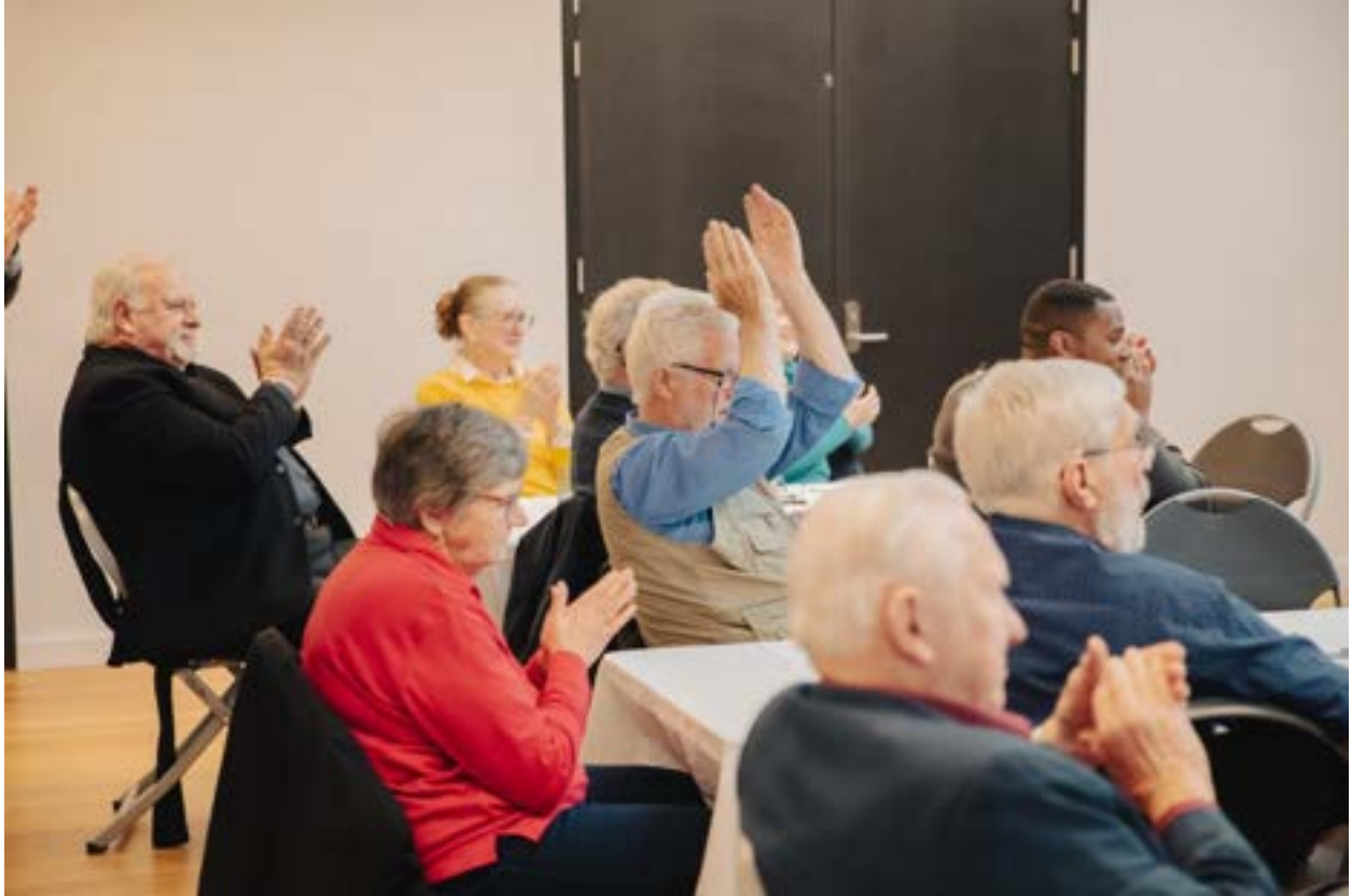
11 - 2RPH guests clapping