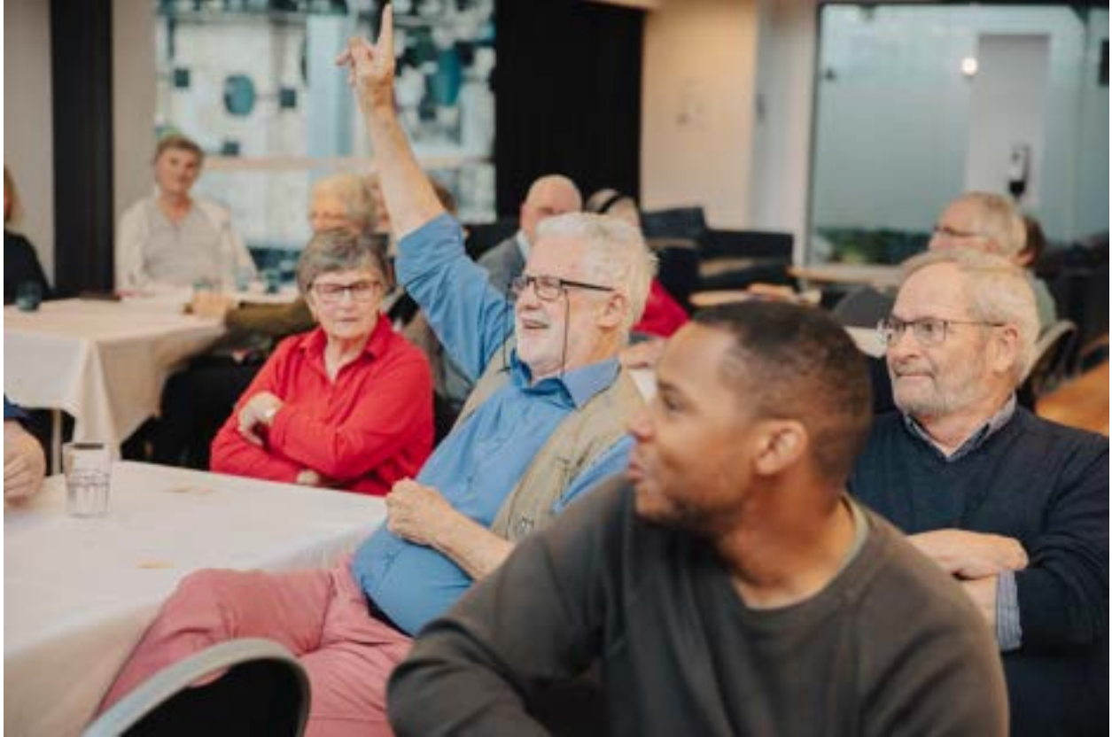
5 - 2RPH volunteers and guests