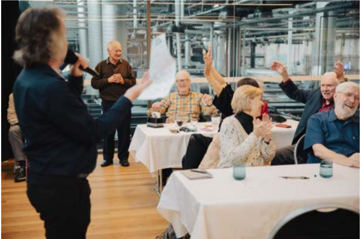
3 - 2RPH guests