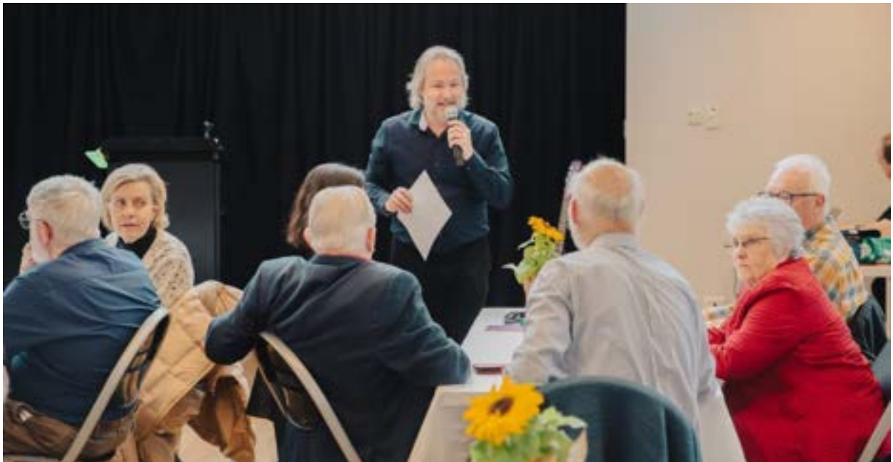
43 - 2RPH guests