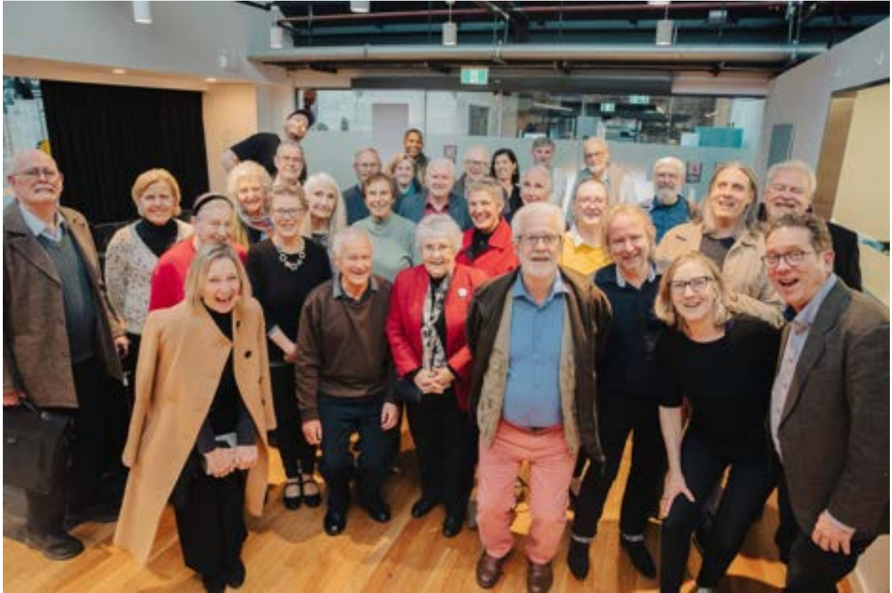
18 - Group shot of guests, staff and volunteers