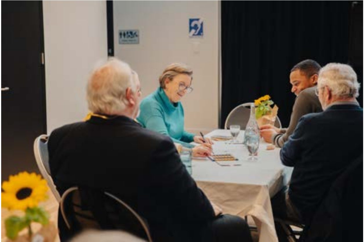
26 - 2RPH guests