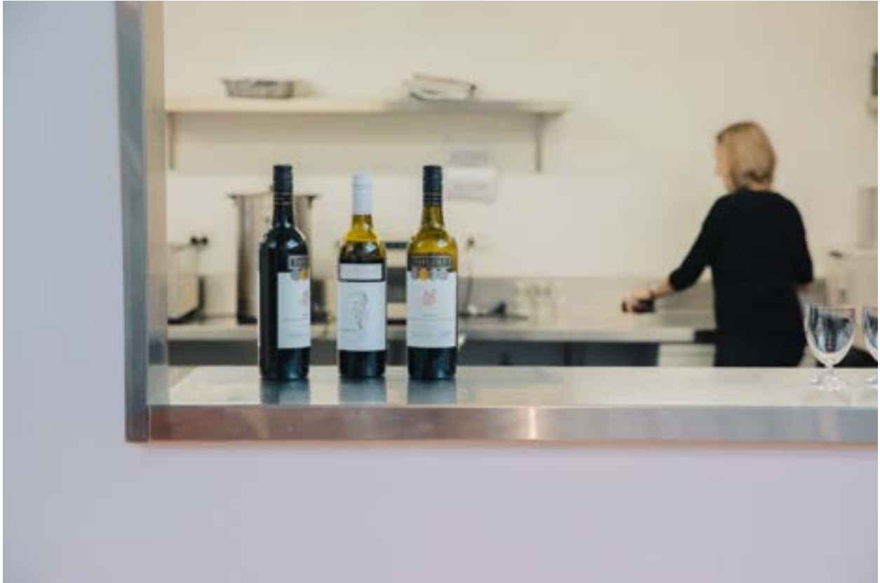
50 - Wine bottles