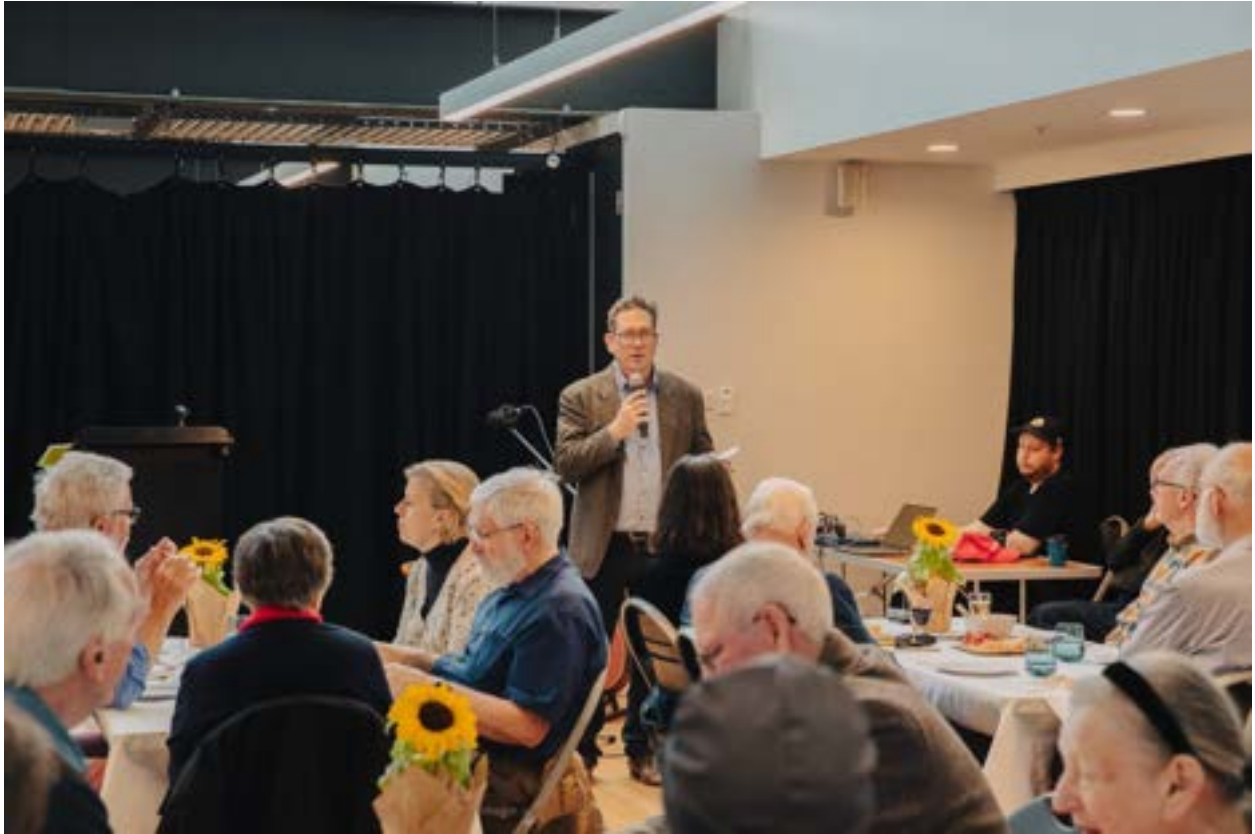
52 - 2RPH guests