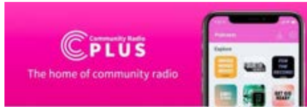
55 - Community Radio Plus