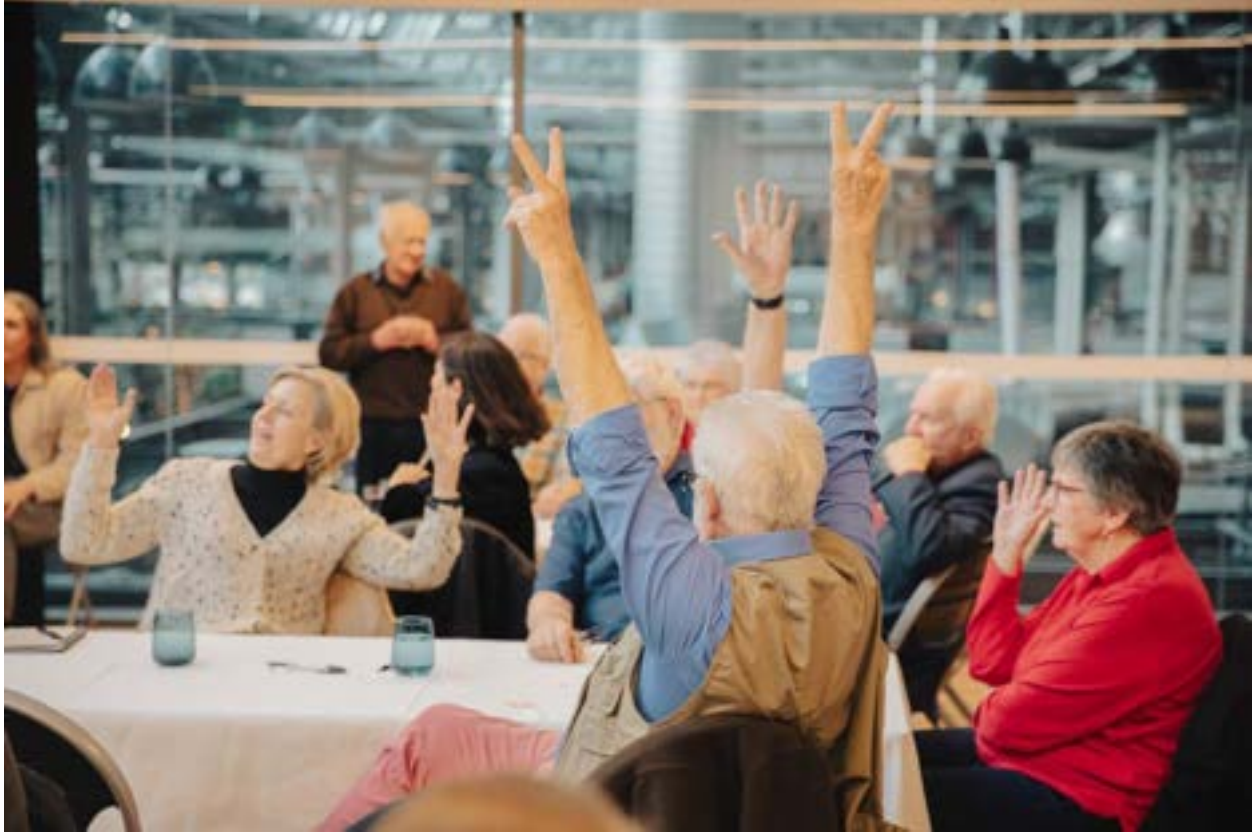
21 - 2RPH guests with hands in the air