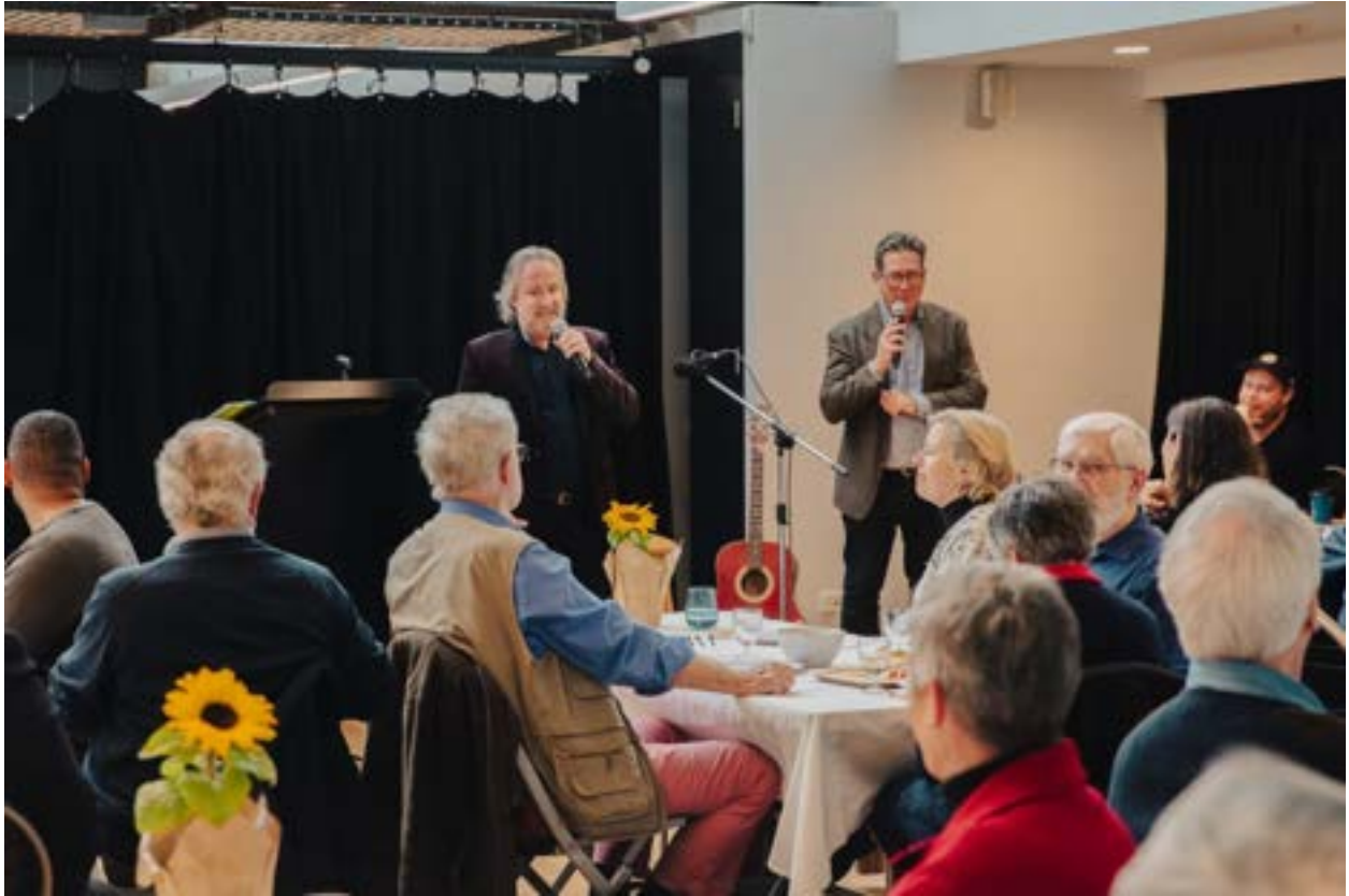
45 - 2RPH guests