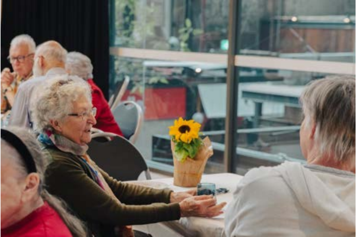
44 - 2RPH guests