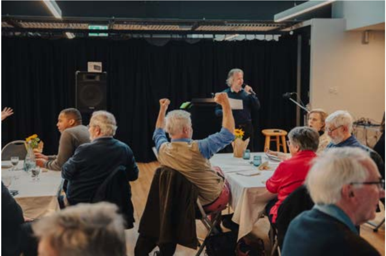
33 - 2RPH crowd shot