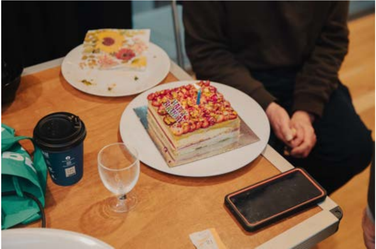
17 - Birthday cake