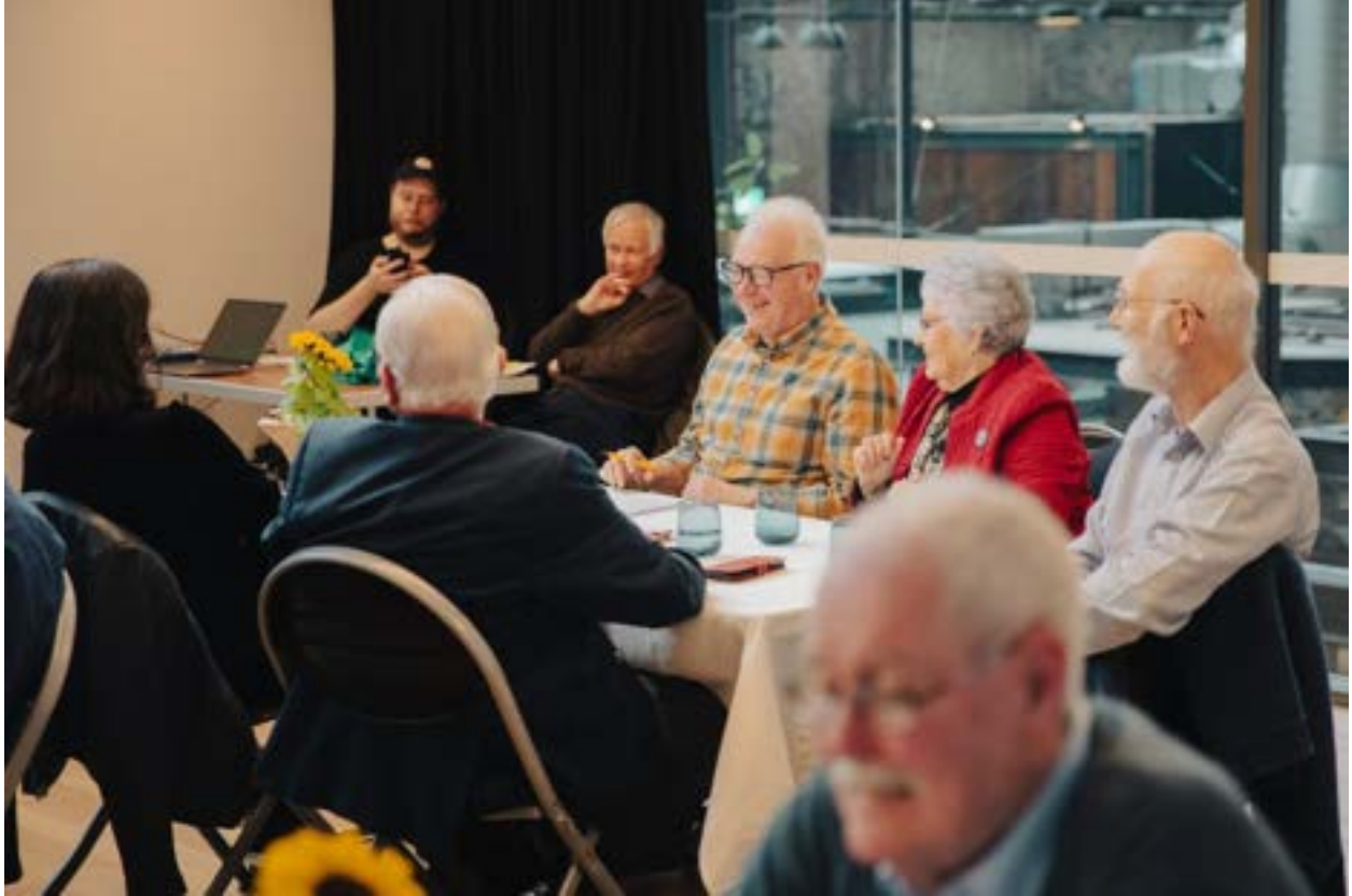
27 - 2RPH guests