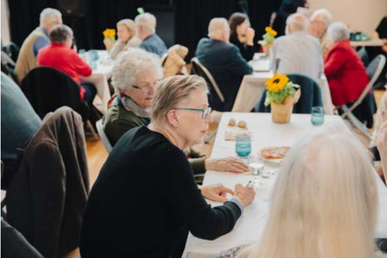
41 - 2RPH guests