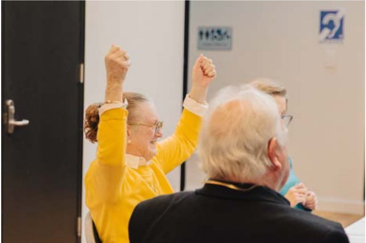
30 - VJ with hands in air