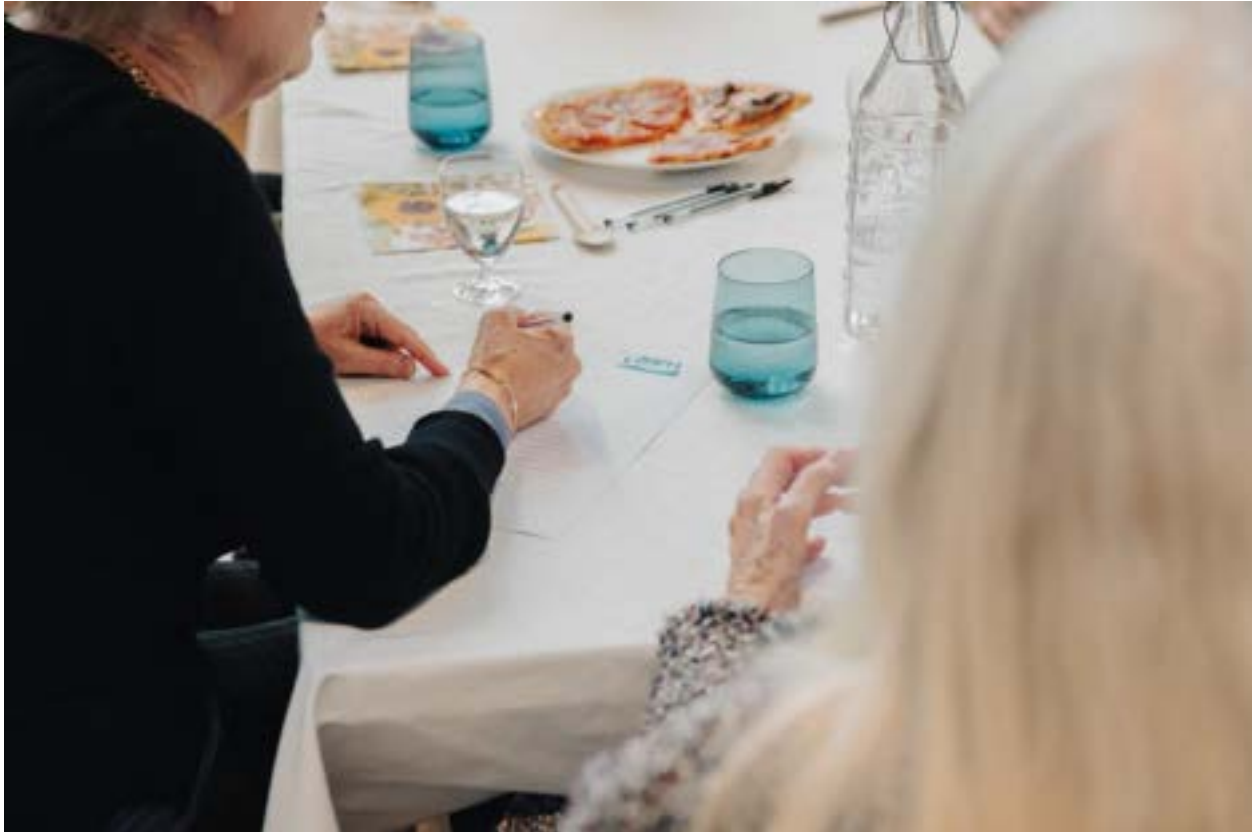
42 - Table and hands